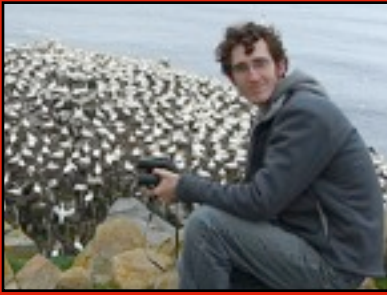
"I heard there were a lot of birds out here but I don't see nothin', man."